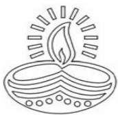
Diwas or Diyas (Dee-va's)